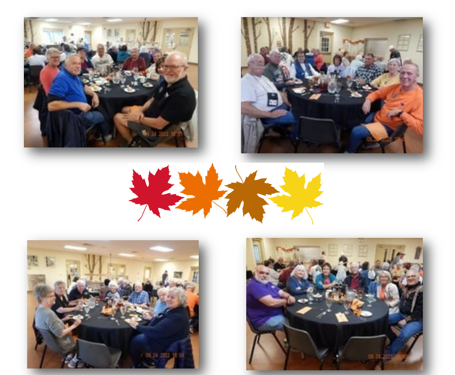
Penn Coachmen enjoying their annual catered meal at Roxbury.