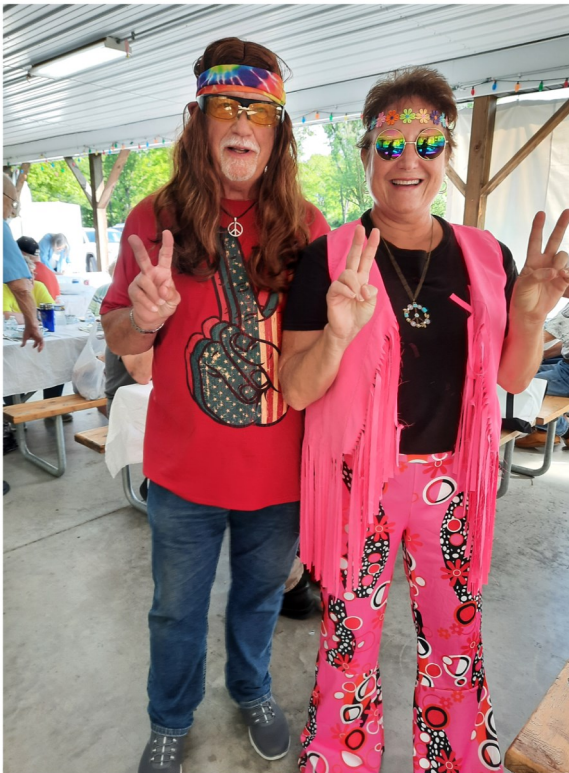
Enjoying the “Theme Night”